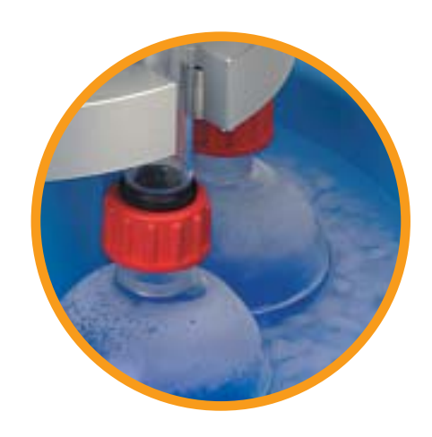
Equal and powerful stirring in all six reaction flasks