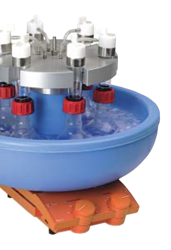
Cooled Carousel 6 Place Reaction Station with six 100ml Reaction Flasks.

Temp. Range Ambient down to -70°C Inert Gas Yes