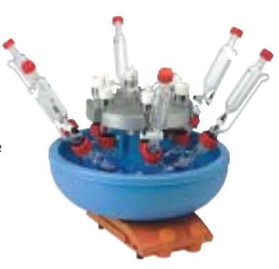
Cooled Carousel System featuring 250ml Reaction Flasks with Sidearm and 50ml Dropping Funnel