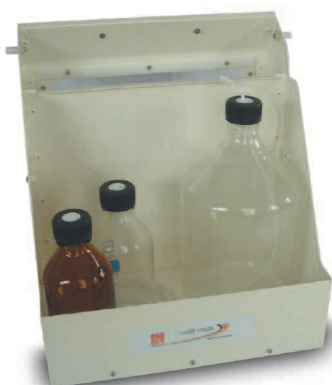
Solvent storage container