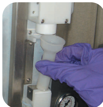
Easy access to reactor for reagent addition or sampling