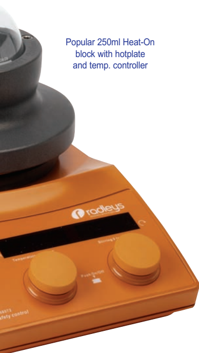
Popular 250ml Heat-On block with hotplate and temp. controller