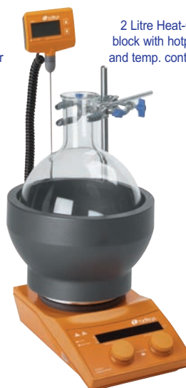
2 Litre Heat-On block with hotplate and temp. controller