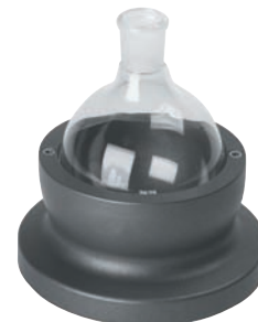
500ml Heat-On block