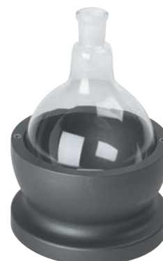
1 Litre Heat-On block