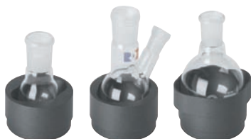
Multi-well flask inserts are available for 10ml, 25ml, 50ml, 100ml & 150ml flasks