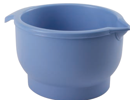
Large Cool-It bowl for flasks up to 2 litres