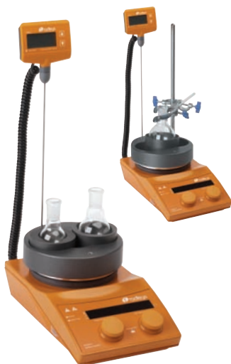
Multi-well Block Holder can accept one or two inserts as required.