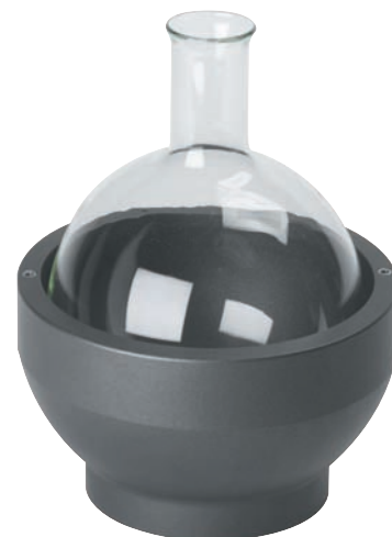
NEW 5 Litre Heat-On block