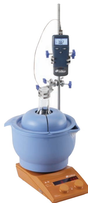
Large Cool-It bowl with lid, stirrer, stand and digital thermometer