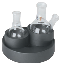
Heat-On Multi-well Block Holder with 50ml and 100ml flask inserts