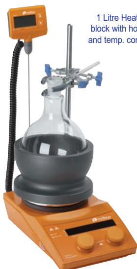
1 Litre Heat-On block with hotplate and temp. controller