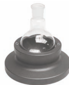
250ml Heat-On block

Each Heat-On block (250ml, 500ml, 1 litre, 2 litre, 3 litre & 5 litre) is a stand-alone product that can be placed directly onto your stirring hotplate - these blocks do not use reducing inserts to accept smaller flasks, thereby maximising heat transfer from a single piece design. All single well blocks feature two probe holes and accept the optional safety lifting handles.