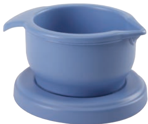
Small Cool-It bowl for flasks up to 400ml