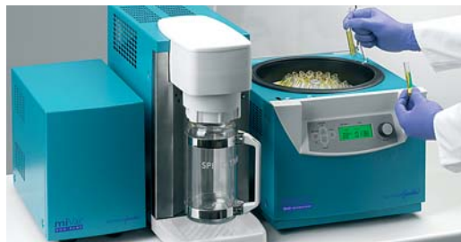
miVac is the first concentrator system with modules designed to work together – and look good.

with built-in pump. Rotors are chosen according to the type of sample format in use and can include both deep and shallow well microplates, glass vials and tubes. Rotors are easily interchangeable.