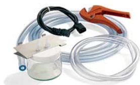
miVac connection kit.

All Duo or Quattro concentrators will need the miVac connection kit. This contains all that is needed to turn the separate units of the miVac series into a fully integrated system. It includes vacuum tubing, a tube cutter, catch pot, and pump control lead.