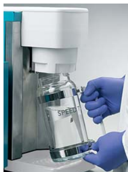
The SpeedTrap jar is extremely easy to remove and empty, requiring just a quarter-turn.

miVac SpeedTrap is supplied with a one litre glass condensing vessel, a two litre option is available for users evaporating very large solvent volumes.